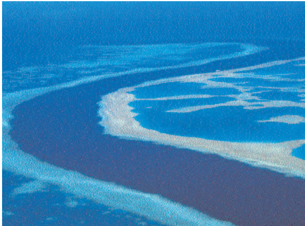
The Great Barrier Reef extends for more than 1,200 miles along the Australian coast.

Barrier Reef Cruise • Discover Australia's magnificent Great Barrier Reef, one of the natural wonders of the world. Cruise from Cairns via speedy air-conditioned catamaran to Agincourt Reef, which teems with a kaleidoscope of underwater life. Then you can opt to walk, swim, snorkel or take a semi-submersible or glass-bottomed boat ride to view the best of this incredible underwater scenery: the electric colors of tropical fish, swaying plants and exquisite corals. Morning tea and buffet lunch are included. (Scuba diving is available for an additional cost as well. Anyone under 18 years old interested in scuba must bring a signed parental release form with them.)